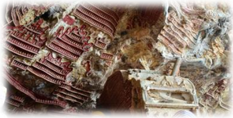
Kawgun Cave in Hpa-an

After breakfast at hotel, proceed to Hpa-an a capital of Kayin State. Appr. 7hrs drive to reach it by road from Yangon across a new Bridge (Thanlwin) over the Thanlwin River- is a scenic destination littered with historical sites and fascinating natural caves. On the way, visit to Bayin Nyi Cave – one of the natural limestone cave & steep Rock in the plains with a monastery at the foot of the mountain. There is a hot spring with bathing possibility. Visit Kyauk Kalab Pagoda which is built on top of a tall and thin natural limestone rock formation. Lunch & Dinner at local restaurant. Overnight at hotel in Hpa-an.