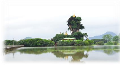
Kyauk Kalab Pagoda in Hpa-an