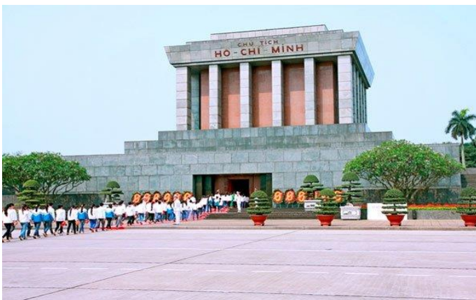
Ho Chi Minh Mausoleum