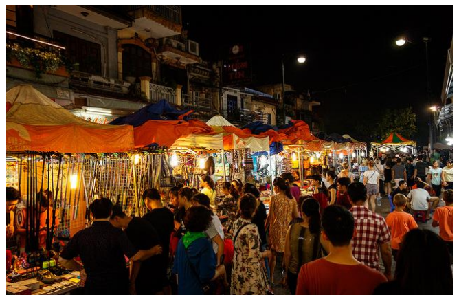
Hanoi Night Market