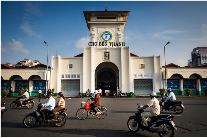
Ben Thanh Market