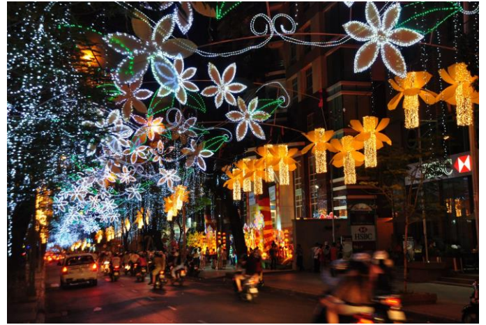
Hochiminh City at night