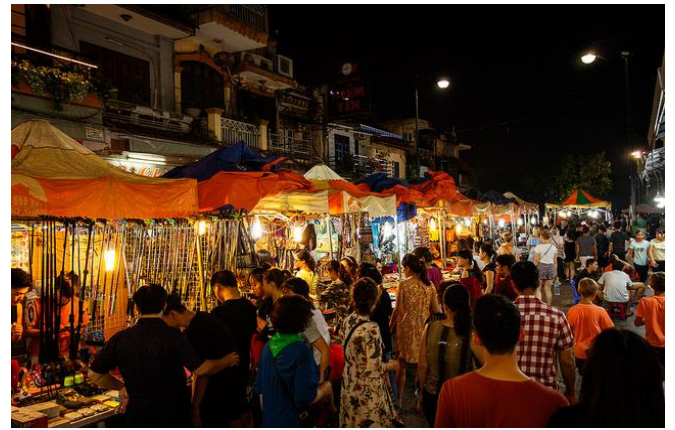
Hanoi Night Market