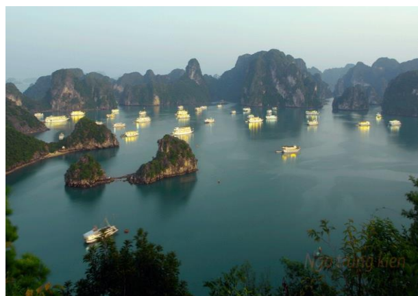
Halong Bay (Sunset)