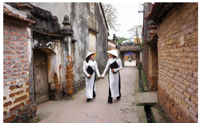
Hanoi Old Street