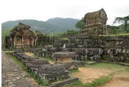
My Son Sanctuary