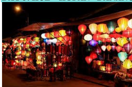
Hoi An Ancient Town