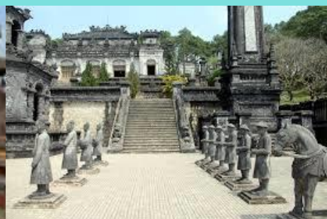
Khai Dinh Royal Tomb

Breakfast at hotel, take the boat trip to visit Thien Mu Pagoda then proceed to visit Royal Citadel , built on 1804. The tour of imperial City features Flag Tower, Noon Gate, Nine Dymastic Urns, Nine Holy Cannons, Thai Hoa Palace, Forbidden Purble city . After lunch, have a visit to Khai Dinh Royal Tomb . In the afternoon. In the afternoon, shopping at Dong Ba Market , dinner then overnight in Hue.