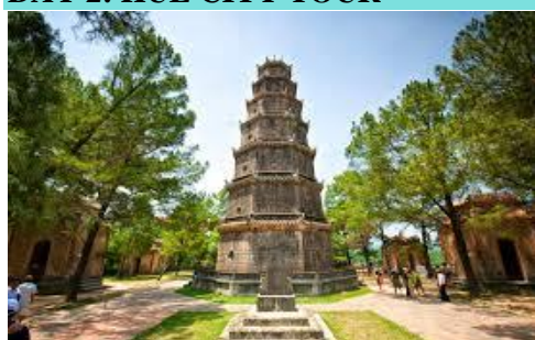
Thien Mu Pagoda