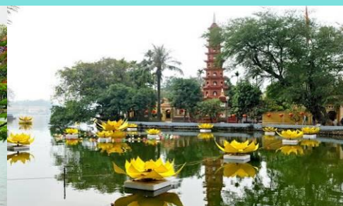
Tran Quoc Temple

Upon arrival at Noi Bai International airport, transfer to Hanoi downtown to visit the West Lake, Tran Quoc Temple, Hoan Kiem Lake (Restored Sword Lake ) and shopping at 36 Old Quarter , enjoy Water Puppet Show .