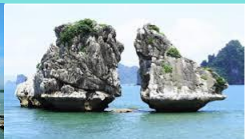
Kissing Chicken Rock

Breakfast at hotel, transfer to Halong Boat station to take our private boat to visit the world Heritage Halong Bay about 4 hours, our boat will bring us to visit Paradise Grotto, Kissing Chicken Rock, Fisherman Village , lunch will be served with fresh Halong Seafood, enjoy Vietnam Coffee on Cruise. Transfer back to Hanoi.