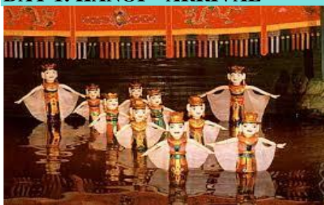
Water Puppet Show