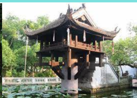
One Pillar Pagoda

Breakfast at hotel, Transfer to visit Ho Chi Minh Mausoleum , Ho Chi Minh Palace , Ba Dinh Square , Uncle Ho' Still House , One Pillar Pagoda , continues to visit Temple of Literature . After lunch, transfer to Halong Bay - UNESCO World Heritage site (160km driving one way - 3.5hrs drive). This will be your first opportunity to see some of the rural areas of Vietnam. The drive goes through the Red River delta, so we'll have plenty of chance for taking photo of Vietnamese farmers tilling the vast green paddy field.