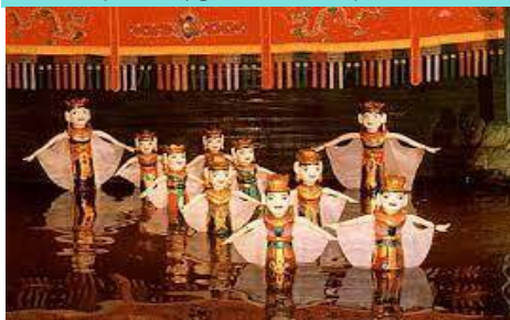
Water Puppet Show