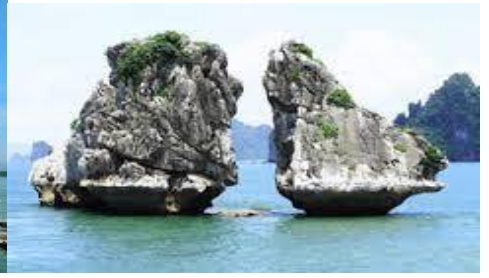
Kissing Chicken Rock

After breakfast, transfer to Halong boat station to take our private boat to visit the world Heritage Halong Bay about 4 hours, our boat will bring us to visit Paradise Grotto, Kissing Chicken Rock, Fisherman Village , lunch will be served with fresh Halong Seafood, enjoy Vietnam Coffee on Cruise. In the afternoon, visit Hoang Gia Casino , Shopping Stop in Halong : Tan Sinh The (Rubber & Bamboo Products) or Ngoc Rong Shop (Jewellery Center).