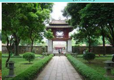
Temple Of Literature