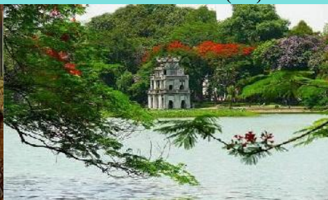
Hoan Kiem Lake