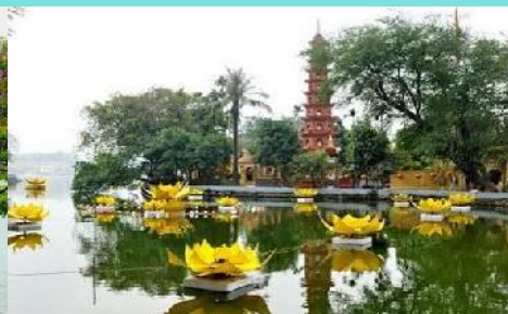
Tran Quoc Temple

Upon arrival at Noi Bai International airport, our representative will meet and transfer to Hanoi downtown to visit the West Lake with Tran Quoc Temple , Hoan Kiem Lake ( Restored Sword Lake ) and shopping at 36 Old Quarter , enjoy Vietnam famous Water Puppet Show .