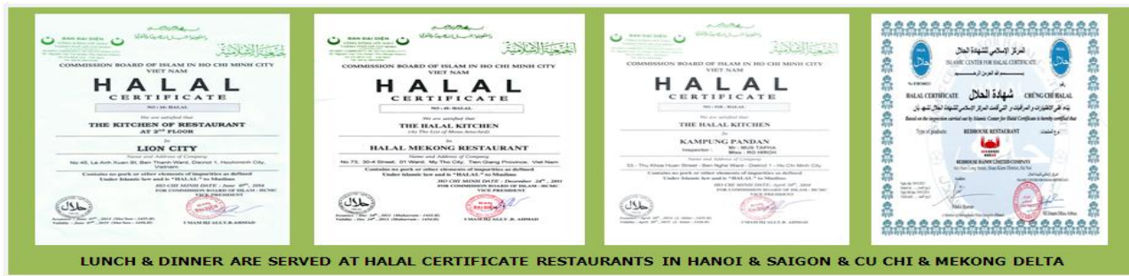
LUNCH & DINNER ARE SERVED AT HALAL CERTIFICATE RESTAURANTS IN HANOI & SAIGON & CU CHI & MEKONG DELTA