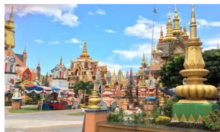
Wat Sai Khao