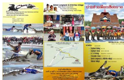
Chang Puak Elephant Camp Chiangrai