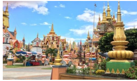
Wat Sai Khao