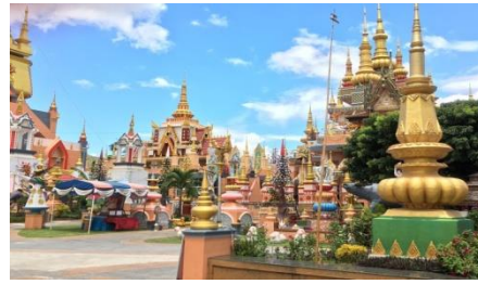
Wat Sai Khao