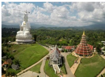
Huay Pla Kang Temple

Chang Puak Elephant (include Elephant Show, Elephant Ride, Crocodiles Show, Mix Hill Tribes)+ Fortune Pagoda (Huay Pla Kang Temple)+Wat Sai Khao+ Golden Triangle, Mae Sai + Doi Suthep Temple+ 3D Museum+ Home Industries +Hot Spring