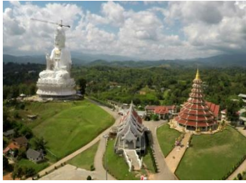
Huay Pla Kang Temple

Chang Puak Elephant (include Elephant Show, Elephant Ride, Crocodiles Show, Mix Hill Tribes)+ Fortune Pagoda (Huay Pla Kang Temple)+Wat Sai Khao+ Golden Triangle, Mae Sai + Doi Suthep Temple+ 3D Museum+ Home Industries +Hot Spring