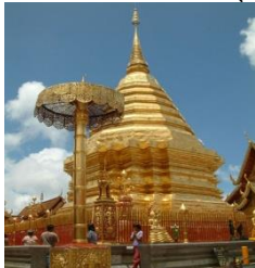
Doi Suthep Temple

After breakfast, visit Doi Suthep Temple at 929 feet above sea level. With a beautiful view of Chiangmai town which can be reached by climbing the steep 300 steps of the winding dragon or the tram car. Its encroaching frosted hill can be enjoyed from the temple compound those who visit Chiangmai would worship here. After lunch visit Art in Paradise 3D Museum Chiangmai , After trip go to have Khantoke Dinner which you can get to know both The Northern Thai food and the Culture passing through the Lanna-Style Performance those will entertain you for all the Dinner time.