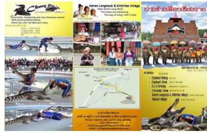
Chang Puak Elephant Camp Chiangrai