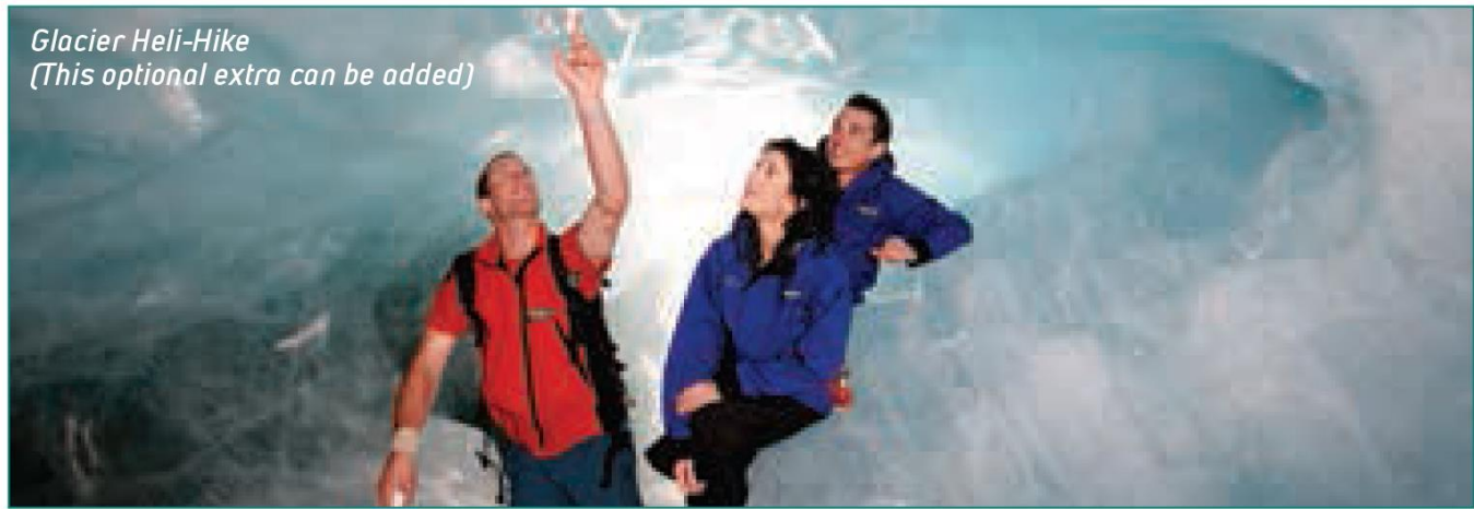
Glacier Heli-Hike (This optional extra can be added)

ADD A scenic flight from Queenstown or the Glacier Region to land on a Glacier.