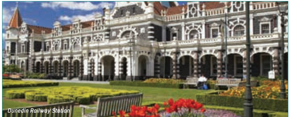
Dunedin Railway Station