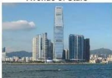
ICC / SKY100