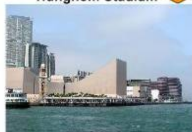
TST East Waterfront