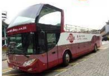
Open Top Bus