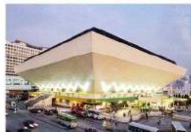
Hung Hom Stadium