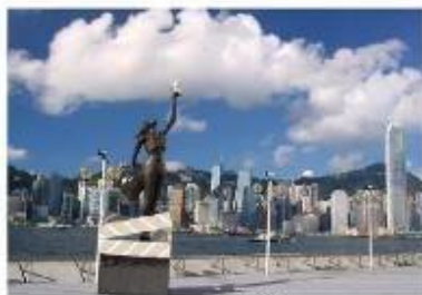
Avenue of Stars