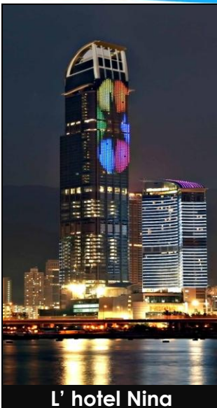
L' hotel Nina