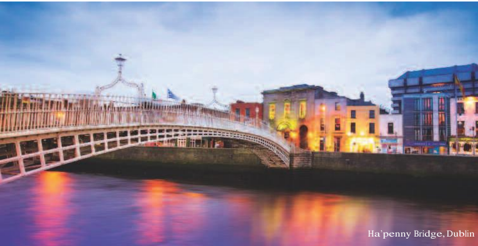
Ha'penny Bridge, Dublin

9 days/8 nights/16 meals or 10 days/9 nights/17 meals