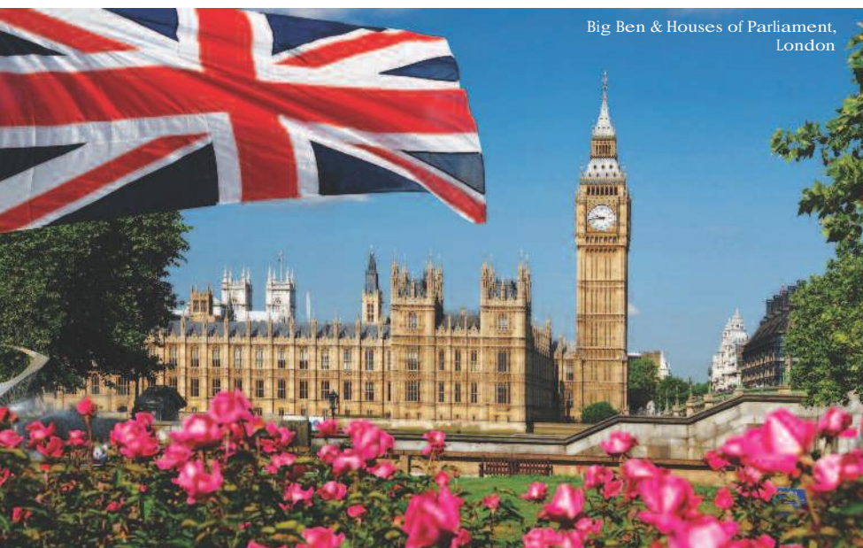
Big Ben & Houses of Parliament, London