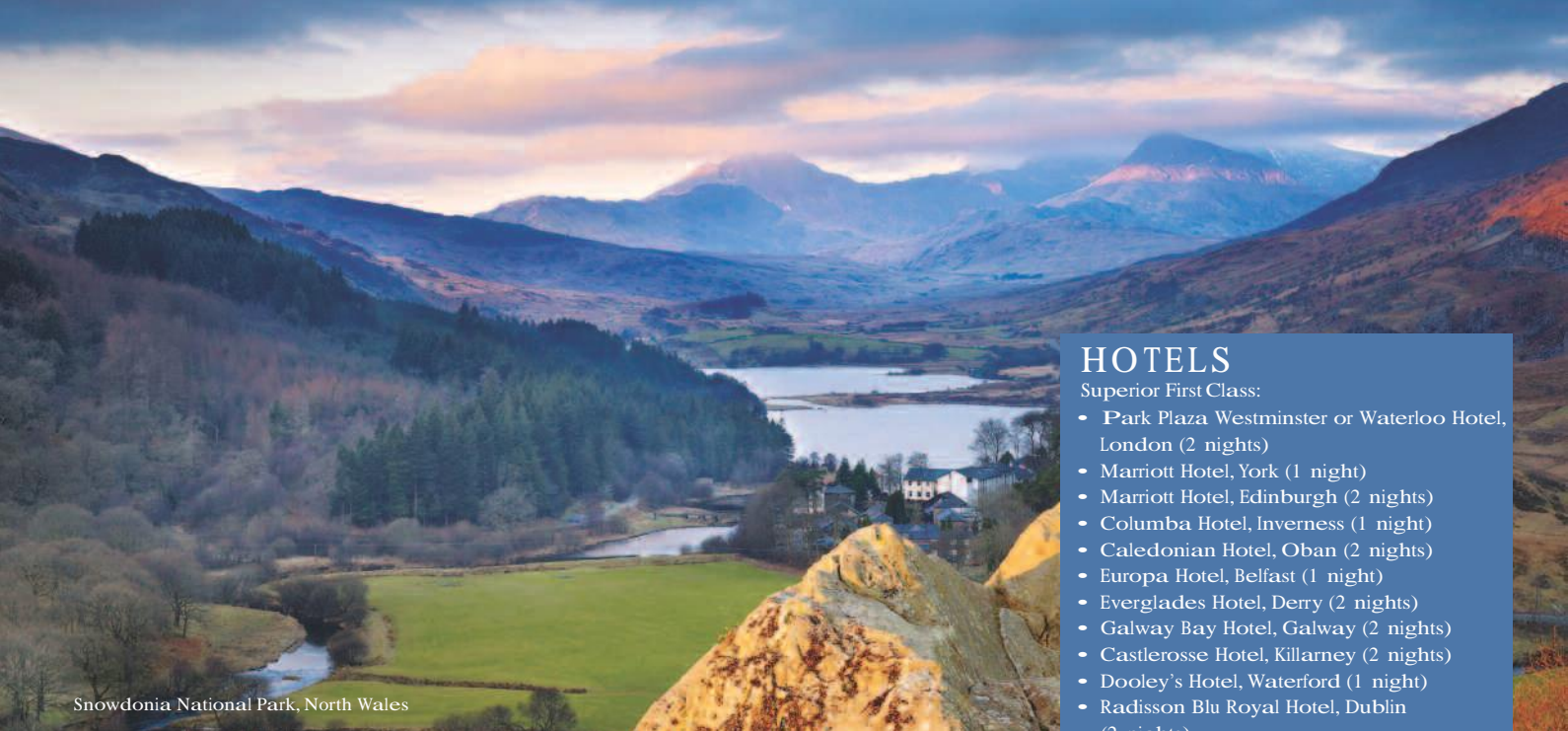
Snowdonia National Park, North Wales