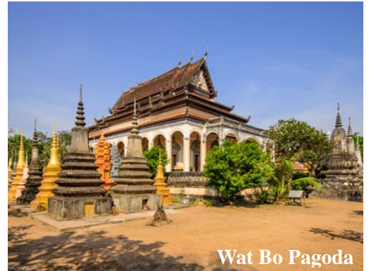
Wat Bo Pagoda