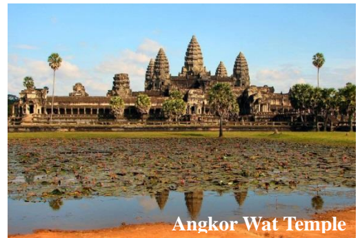
Angkor Wat Temple

After breakfast, visit to The South Gate of Angkor Thom: Bayob Temple, The Royal Enclosure, Phimeanaka, Elephant and Leper King Terrace . Continue visit to Ta Promh (the jungle temple). After lunch, visit to Thommanan, Chaosay Tevoda, Ta Keo : small, attractive temple in very good condition, built all the same time as Angkor Wat. Continue to Angkor Wat : The "7th Wonders' of the World". World Heritage Site since 1992, famous for its beauty and splendor. Angkor Wat features the longest continuous bas-relief in the world, which runs along the outer gallery walls and narrates stories from Hindu mythology. Continue visit to Bakheng Hill : Sunset viewing on the top of the hill. Bakheng is the first major temple to be constructed in the Angkor area; this temple-mountain offers extraordinary views of the Tonle Sap and Angkor Wat. (Visit to Night & Pub Street)