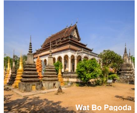
Wat Bo Pagoda

Pick up from the airport and transfer to the hotel check in. After successfully checking in the hotel, we take short walk along the road in front of the King's Residence to see the Main Shrine, where the local people usually worship, with its statue of Yeay Teap, Preah Ang Chek and Preah Ang Chorm . Buying jasmine and lotus flowers to worship is very important for the Cambodians. Then continue to Wat Bo , a large, highly respected pagoda, founded in the 18th Century. Like the Silver Pagoda in Phnom Penh, the vihear of Wat Bo contains unique wall paintings of the Reamker that are said to be late 19th Century. Look for the daily-life market scenes such as an opium smoking Chinese merchant, the colonial era French officer at the market and the French soldiers attending a traditional dance performance. Also of interest is the large collection of Buddha statues located behind the main Buddha. We will continue to " Chantiers Ecoles - Les Artisans d'Angkor " which provides training to young Cambodians in an effort to revive the ancient Khmer traditions of stone carving and wood sculpting. Overnight at the hotel in Siem Reap