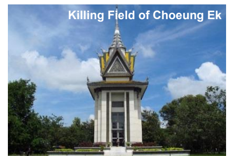
Killing Field of Choeng Ek

Breakfast at hotel. Visit Tuol Sleng Museum (S-21 prison) . This former school was used as a prison by Pol Pot's security forces. More than 17,000 people held at S-21 were taken to the extermination camp at Choeng Ek to be executed. Visit Russian Market (Toul Tumpung Market), the Market has gained reputation for cheap clothing, a large selection of Buddha images and woodcarvings, betel-nut boxes, silk, silver jewelry, and classic music instrument. Transfer to the airport for the flight departure